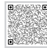
车衬衫领尖 Sewing shirt pointed collar