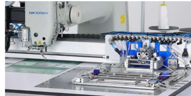
NT8100A-8045-D/KD01 (激光 + 开袋功能) (Laser + pocket welting function)