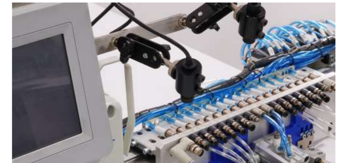
镭射定位红外线 laser positioning infrared