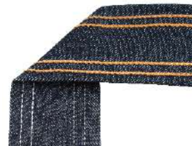
Waist band JK-8009HF